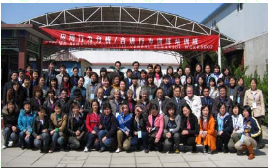
April 2008 Autism Workshop Beijing Presenters, delegates SCL Directors & Stars & Rain staff