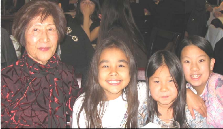
Photograph by permission